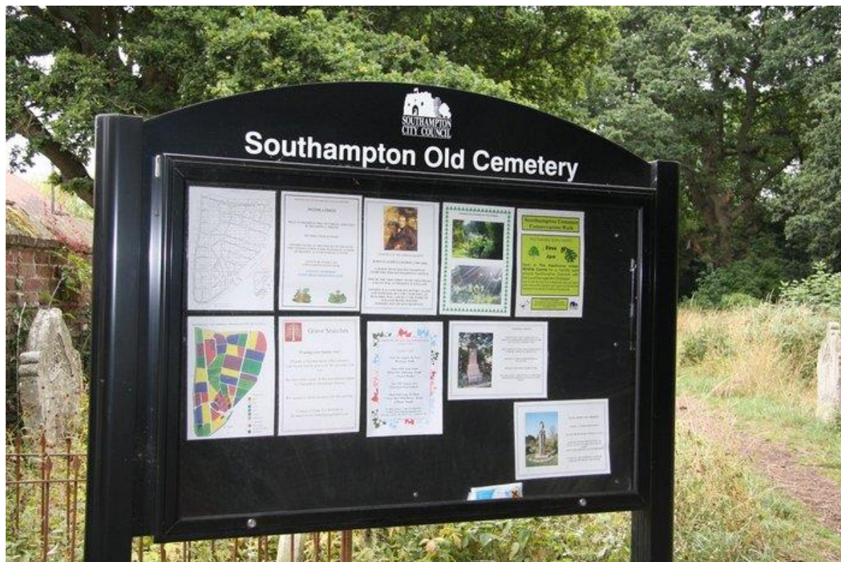
Southampton Old Cemetery