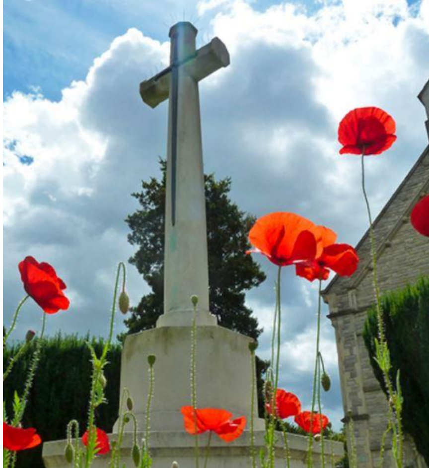
Cross of Sacrifice